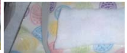
Tape fuzzy fabric to front and using the placement stitches positioning. Sew #2 in white