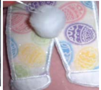
Remove from hoop cut out a satin stitch. Hand sew or hot pom pom for tail. Print above poem and place Smarty's Candy in each leg.