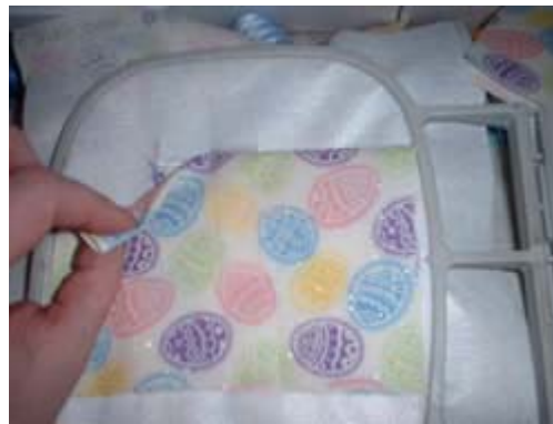
Take hoop off machine and fold back fabric in half so fold is even with top stitching. Sew #6. Remove hoop from machine trim close to stitching. Place back on machine and sew out #6 outline.