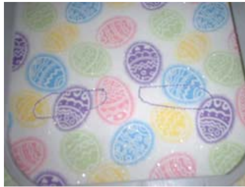
Stitch #1 Placement stitches for feet