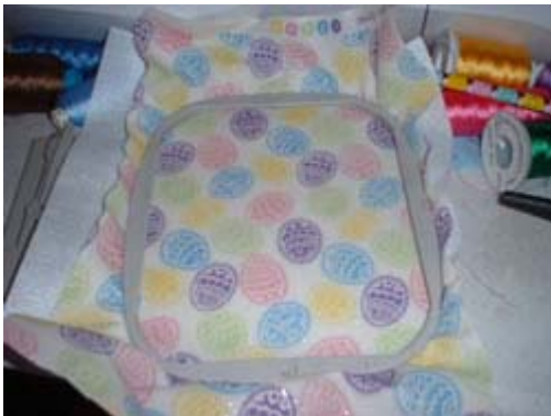
Hoop using cut away stabilizer