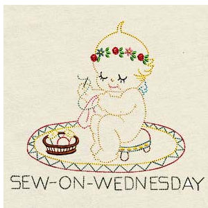
Wednesday H5.50 W4.50