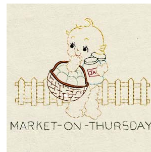
Thursday H6.00 W4.46