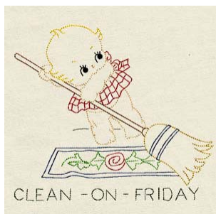
Friday H5.56 W4.61