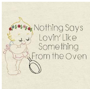
Lovin H5.85 X W3.85