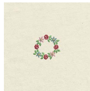
Quilt Button H1.0 W1.0