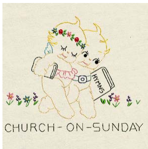
Sunday H4.70 W4.90