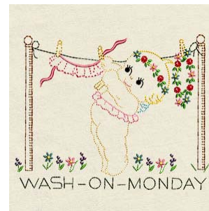
Monday H6.00 W4.44