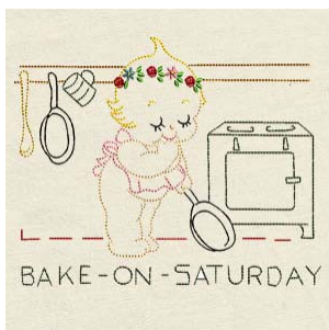
Saturday H5.85 W5.00