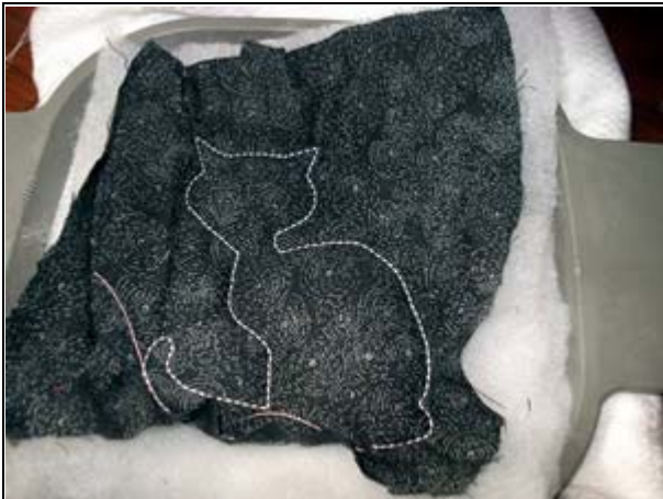
Sew the secure stitching.

Place batting and fabric over placement stitching. I used two pieces of batting for extra fluff. If you use two pieces of batting you may want to hold down the fabric in place while sewing on slow or tape it down.