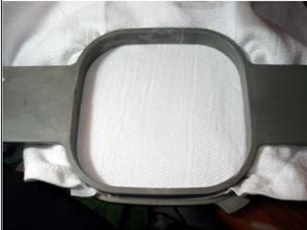
Hoop Fabric with stabilizer