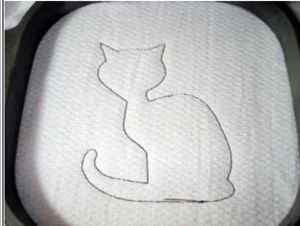
Sew placement stitch