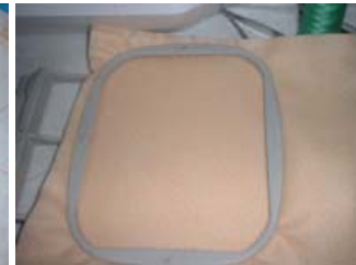
3. Hoop stabilizer using spray adhesive attach tan felt to stabilizer.