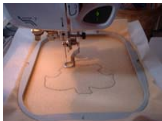
4. Sew applique placement