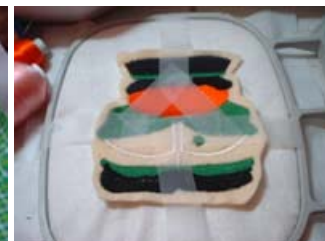
6. Sew next 7 colors stopping at black satin