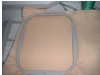
1. Hoop stabilizer using spray adhesive attach peach felt to stabilizer.