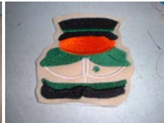
2. Sew out back first. Take out of hoop. Trim, Set a side.