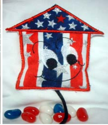
12. Remove from machine and trim

Turn over and tape back to front with backsides together. Place a small piece of rat tail inside bottom for fuse.