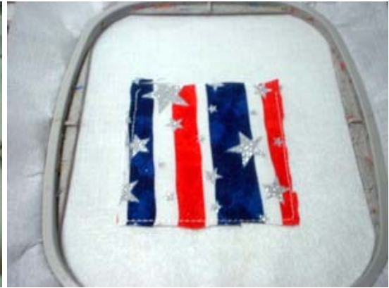
3. Sew first color , trim about 1/8 from stitching.