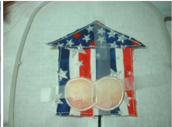
10. Stop before last satin stitch. Leave in hoop but remove frame from machine.