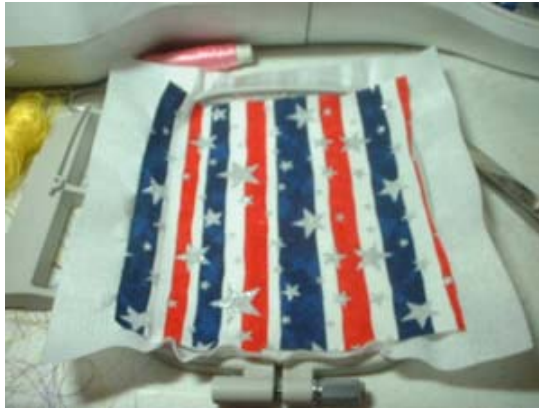
2. Place piece base fabric on top of frame