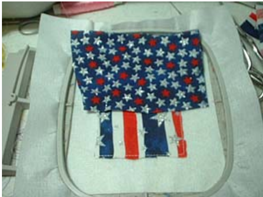
4. Place top half fabric. Sew next color in.