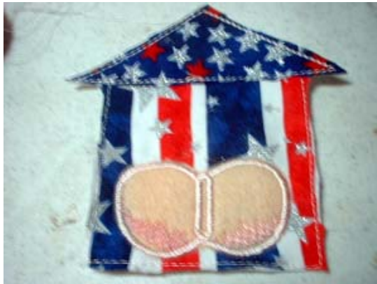
8. Satin stitch around butt. Remove design from hoop trim then set a side. 9.