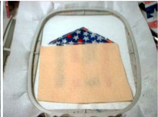
6. Place flesh color felt over bottom half.