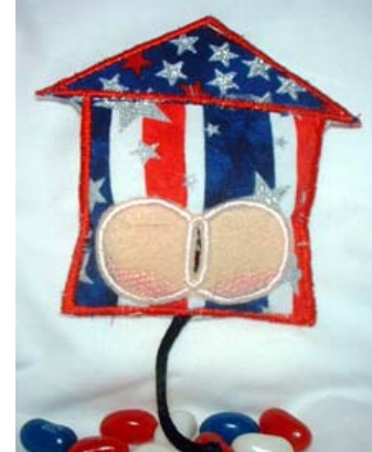
13. Fill with red, white and blue jelly beans. Attach poem and give away to your naughty friends.

Turn over and tape back to front with backsides together. Place a small piece of rat tail inside bottom for fuse.