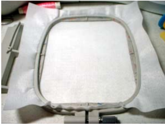
Sew Back First 1. Hoop stabilizer.