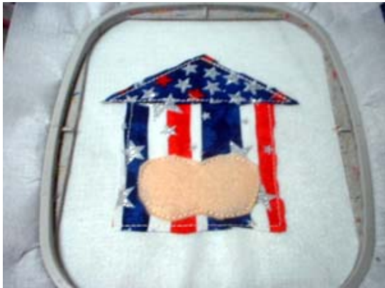
7. Sew next color and trim.