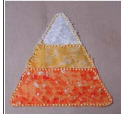
12. Sew secure stitch 13. Trim fabric