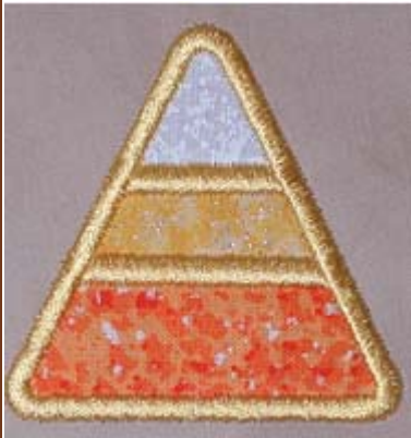
13.Sew Yellow finish outline stitch