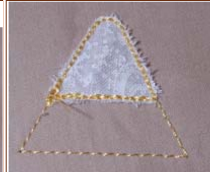
4. Sew secure stitch 5.Trim fabric 6.sew next guide stitch