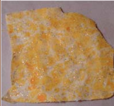
7.place yellow fabric over guide