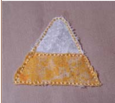
8 .Sew secure stitch 9.Trim fabric