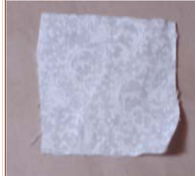
3.Place fabric over guide.