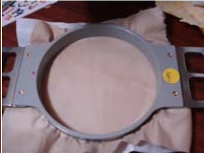
1. Hoop your fabric