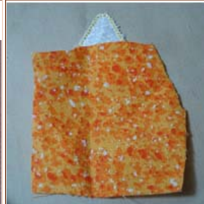
10. Sew next guide stitch 11.place orange fabric over guide